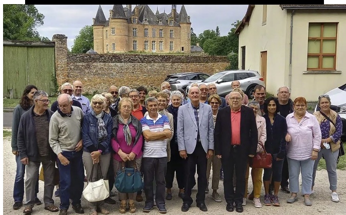
Members of Dymchurch and Salbris Twinning Association on a visit to a privately owned chateau kindly arranged by the Mayor of Salbris

2023 will mark 41 years since Salbris in France first established a link with Dymchurch, initially via our two fire brigades, before being formalised into The Twinning Association we know today. Twinning aims to develop cultural, tourist, economic and social relations with exchanges between the two towns, occurring twice a year. In 2022 Dymchurch members were able to visit Salbris once more for a long weekend and as always, enjoyed a wonderful time visiting Châteaux, enjoying all the delights of French cuisine and the hospitality of our individual hosts.